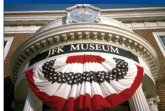
Visit to the JFK Museum