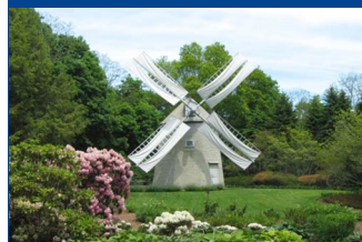
One of Cape Cod's many Windmills