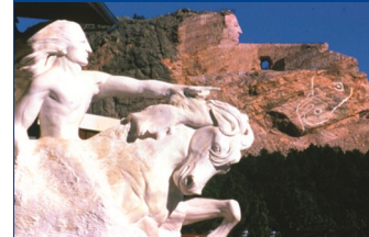
Crazy Horse Monument to be 10x the size of Mt. Rushmore