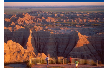
Spectacular Badlands National Park