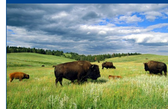
Wildlife enhances the pristine Black Hills