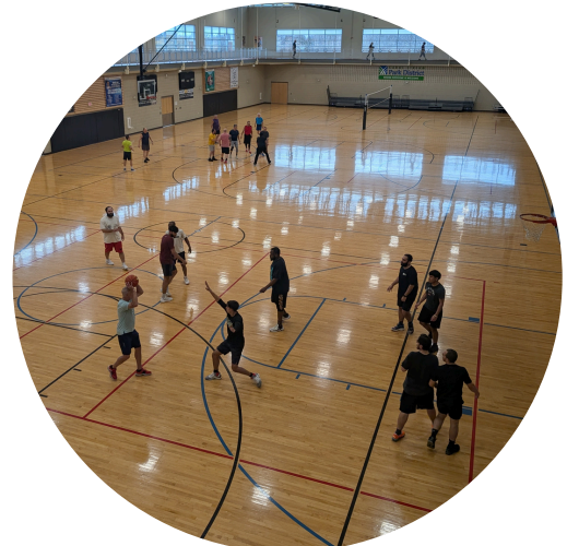
Open Gym Basketball