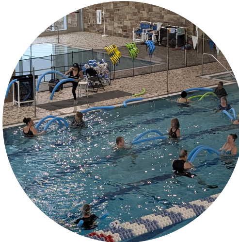
Indoor Lap & Therapy Pool