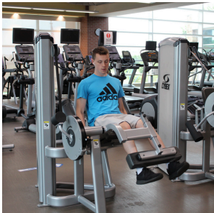
Cardio & Strength Training