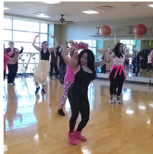
Unlimited Fitness Classes