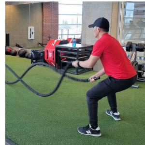
Turf for functional training